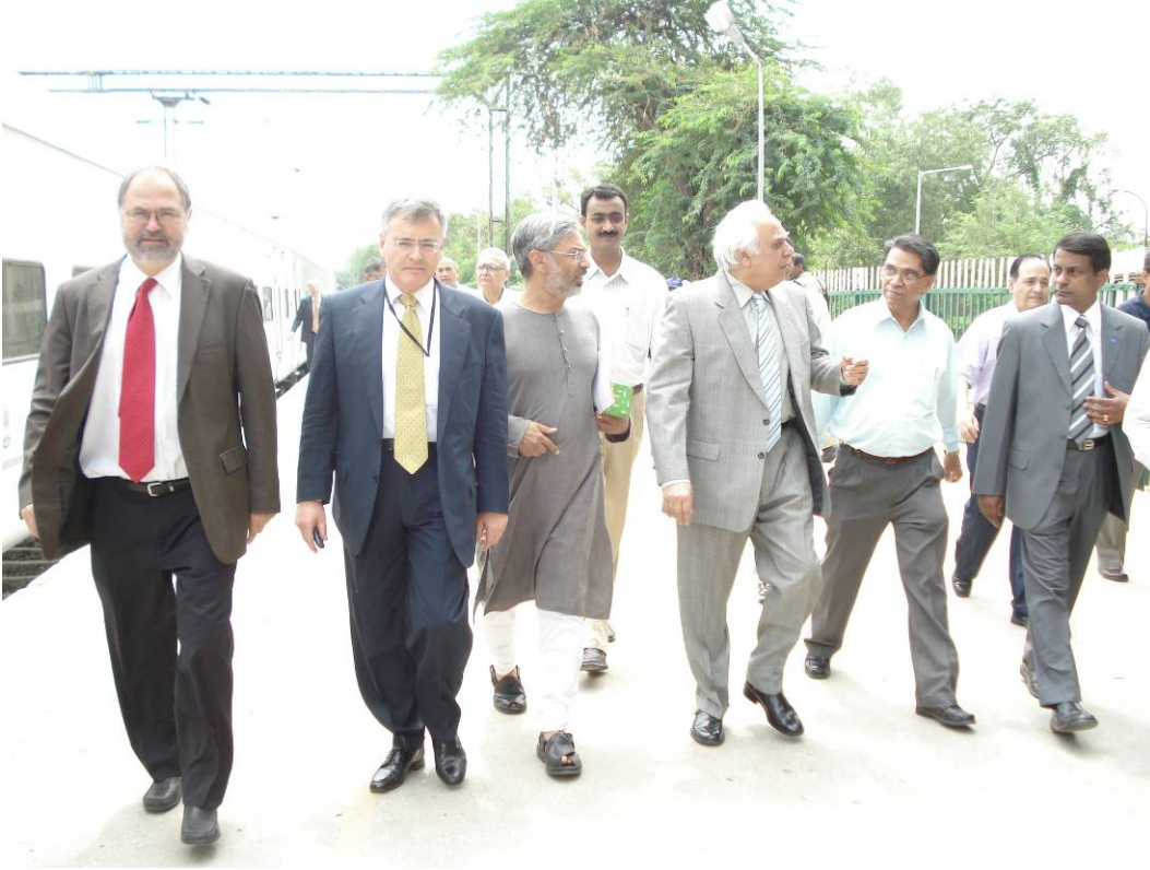
The final walk at Safdar jung Railway Station-on the success of the Science Express