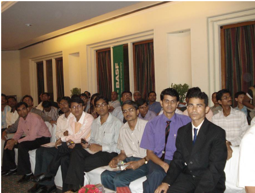
The Science Express team