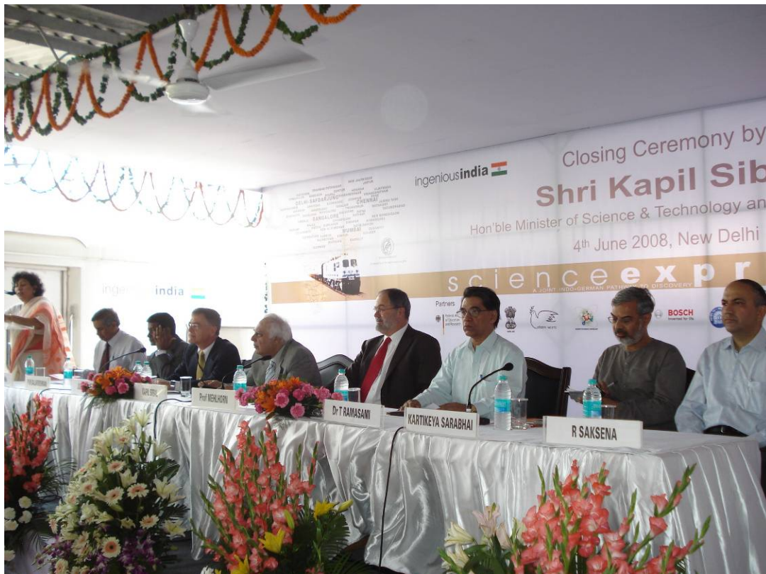
Glimpses of the closing ceremony

The Honorable Ministers and the guests visited the Science Express after the completion of the ceremony. Refreshment was arranged for all, after the ceremony got over.