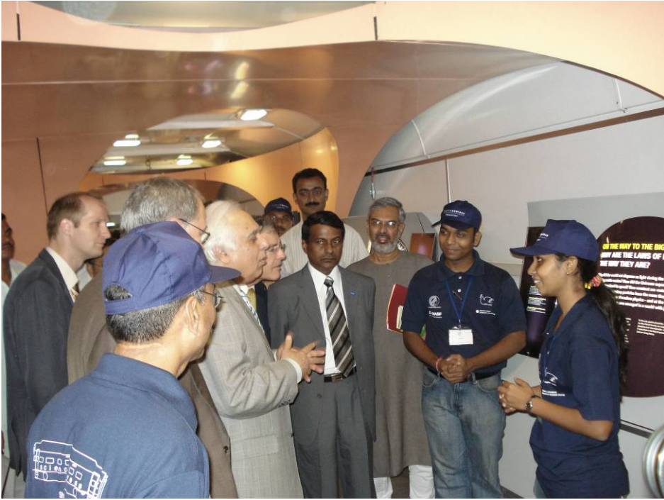
An interaction of the Honorable Minister with the Science Express team