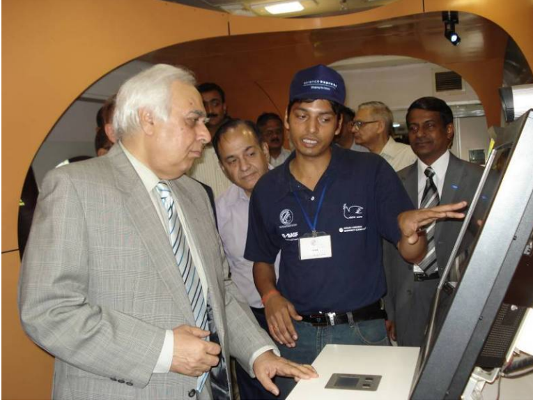
Shri Kapil Sibal, Union Minister, Science and Technology and Earth Sciences exploring the exhibits